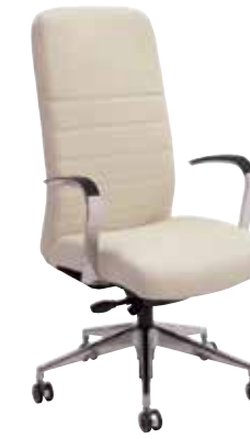
584: High Back