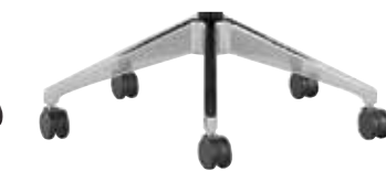
Powder Coated Silver