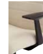
Fixed Black T