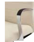
Aluminum Fixed Loop