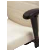
Black Height Adjustable T with Fixed Arm Pad