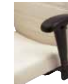
Black Height & Width Adjustable T with Fixed Arm Pad