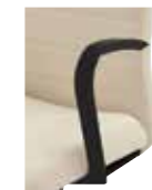
Black Fixed Loop