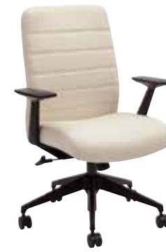
582: Mid Back