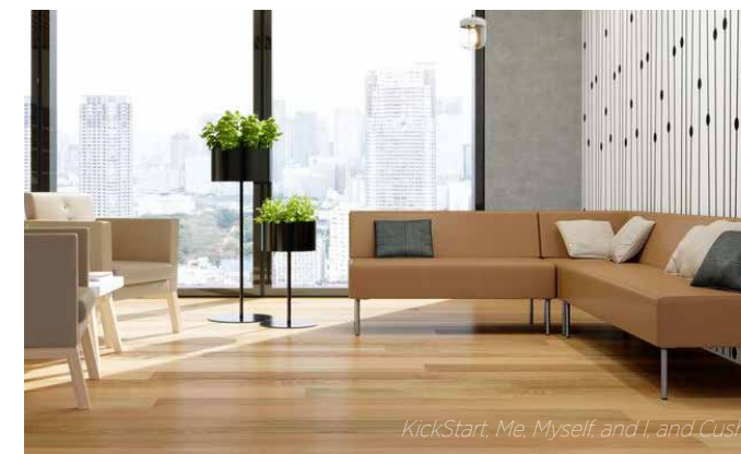
KickStart, Me, Myself, and I, and Cush

Seating and table collections like Plush, Isla, and KickStart seamlessly bring together the endurance needed for commercial spaces with the relaxed comforts of home to create inviting spaces for people to gather, work, re-energize, and learn.