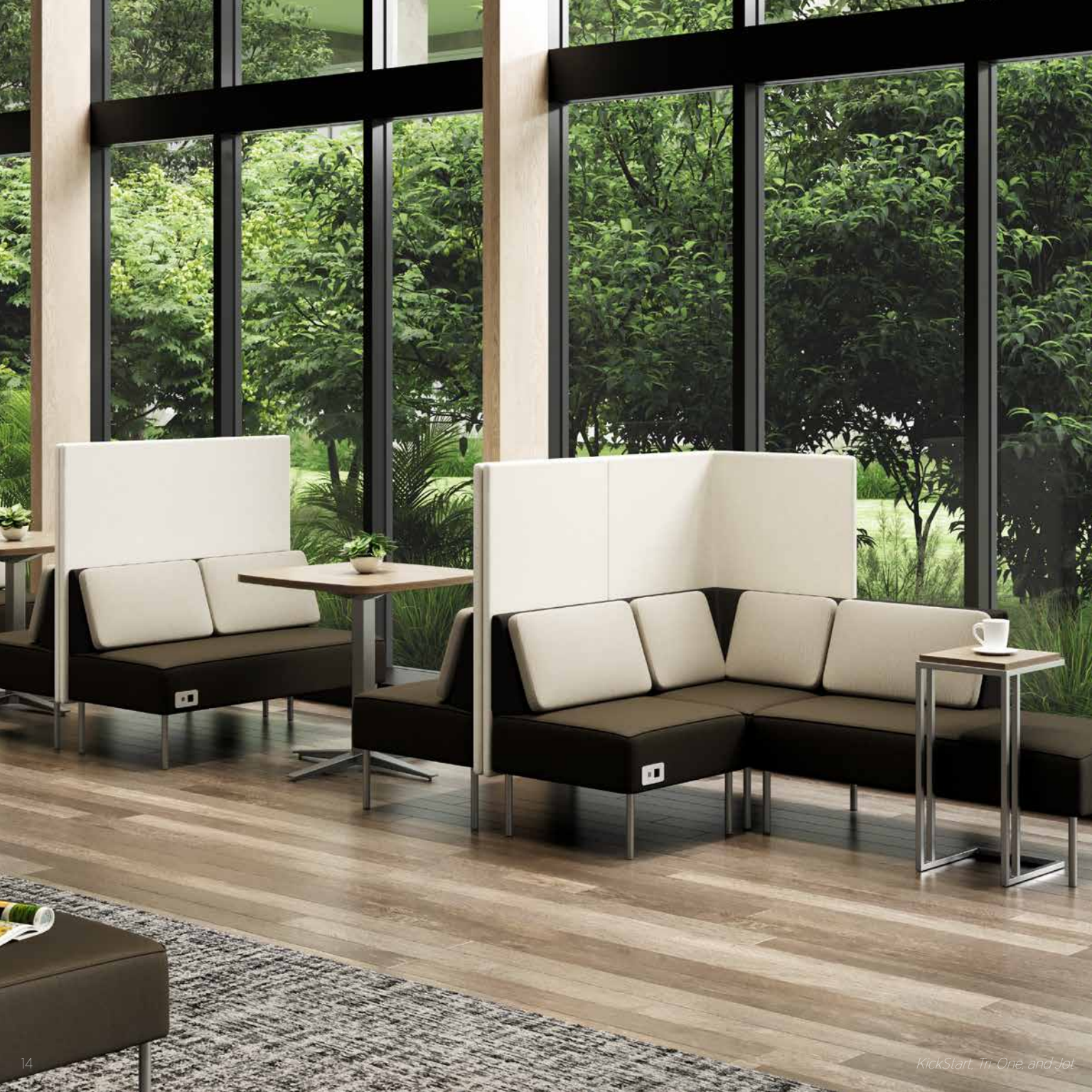
KickStart, Tri-One, and Jet