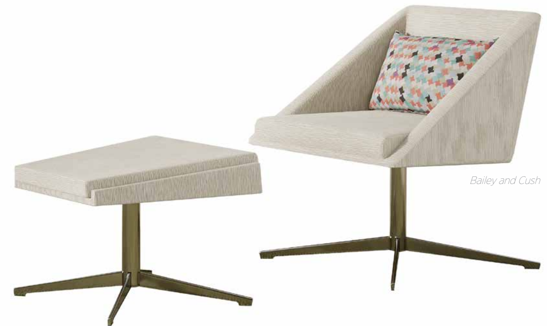
Bailey and Cush

This is necessary to feel and be well, and it ultimately will increase overall satisfaction, productivity, and lead to a stronger culture.