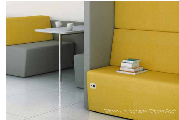
Fifteen Lounge and Fifteen Pods