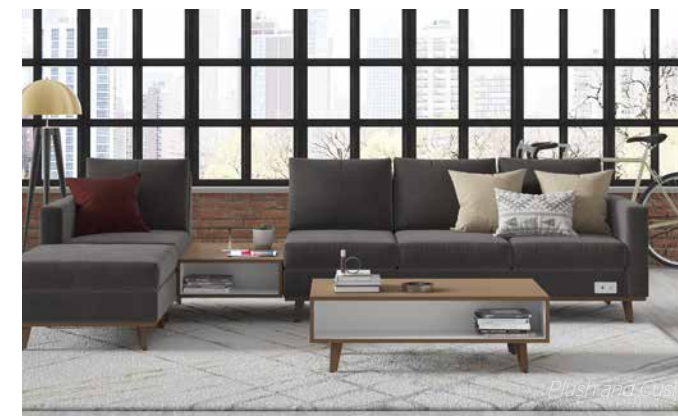
Plush and Cush