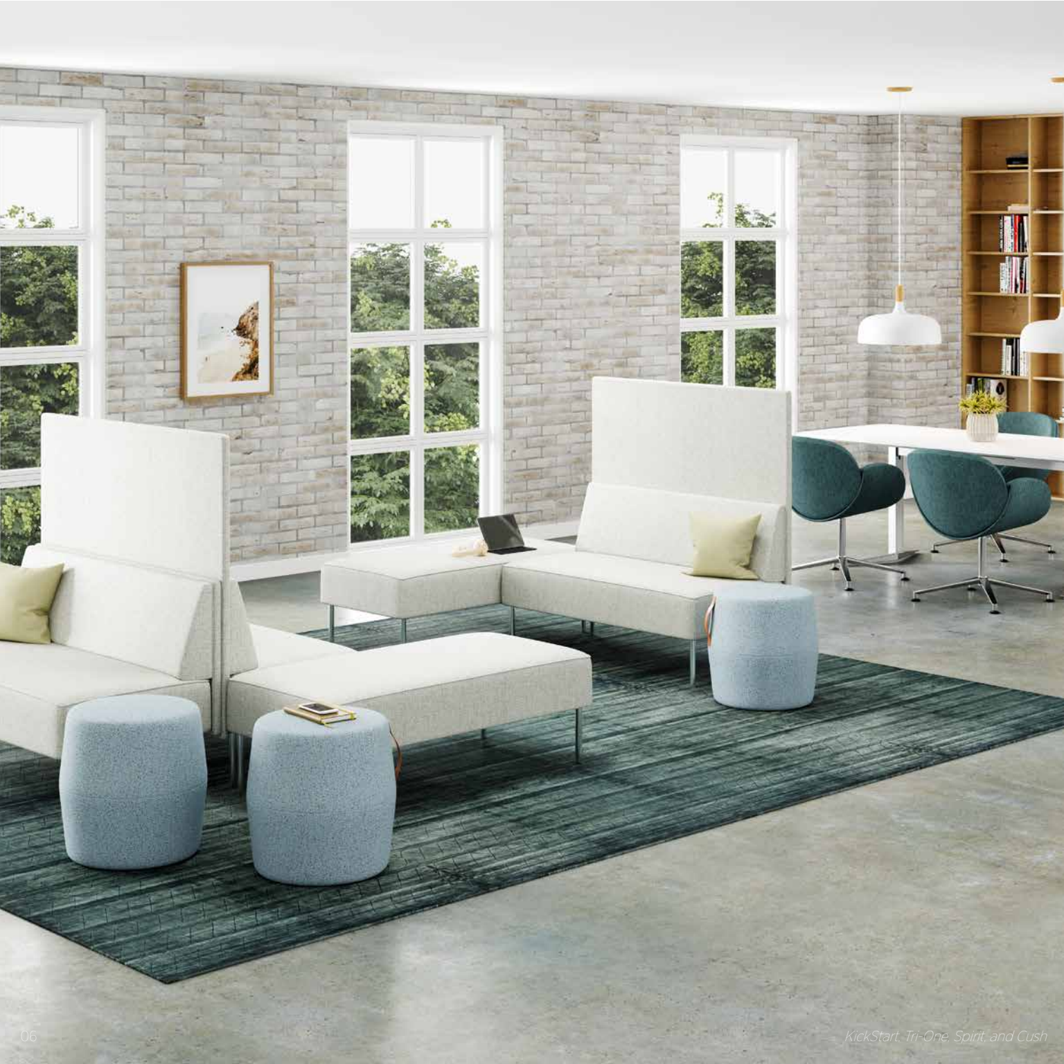
KickStart, Tri-One, Spirit, and Cush