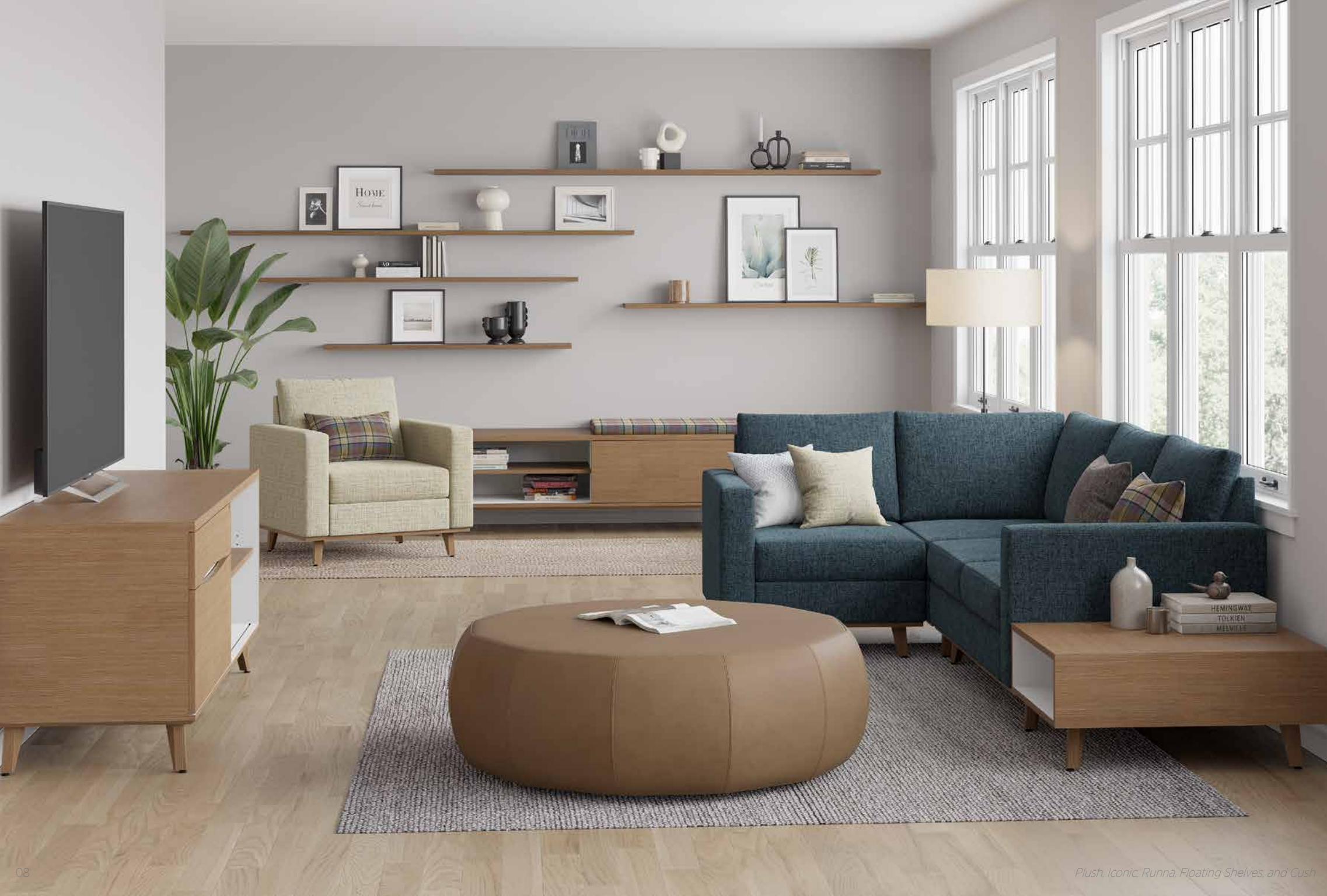
Plush, Iconic, Runna, Floating Shelves, and Cush